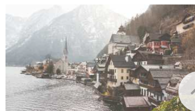
The Viking's Guide to Good Business by King's Mirror