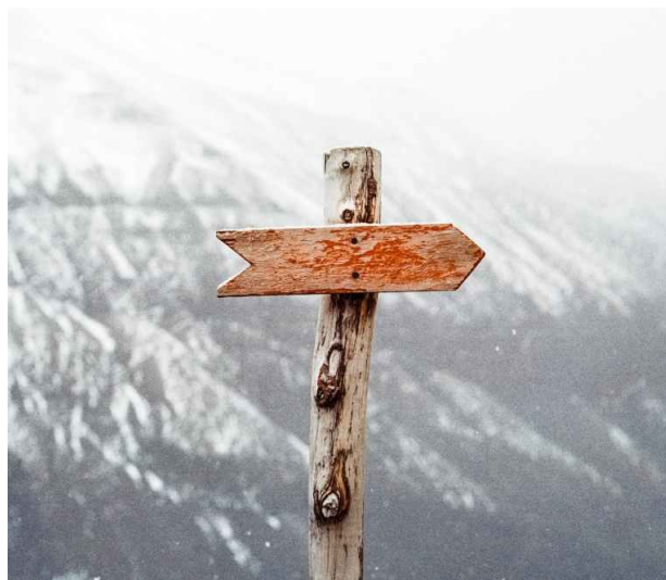
Lead the way